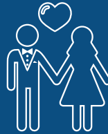
Child Wedding Planning