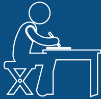
Child Education Planning